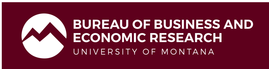
C: White logo

Black with white background. Best logo when "one color/black" is needed.